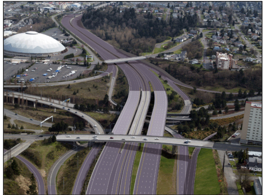
Interstate 5 - Proposed