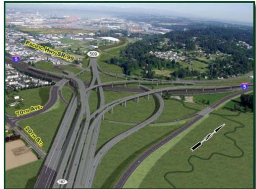
Interstate 5 - Proposed