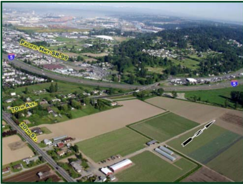
Interstate 5 - Existing

Note: Additional stakeholders dedicated $26 million to SR 167's completion