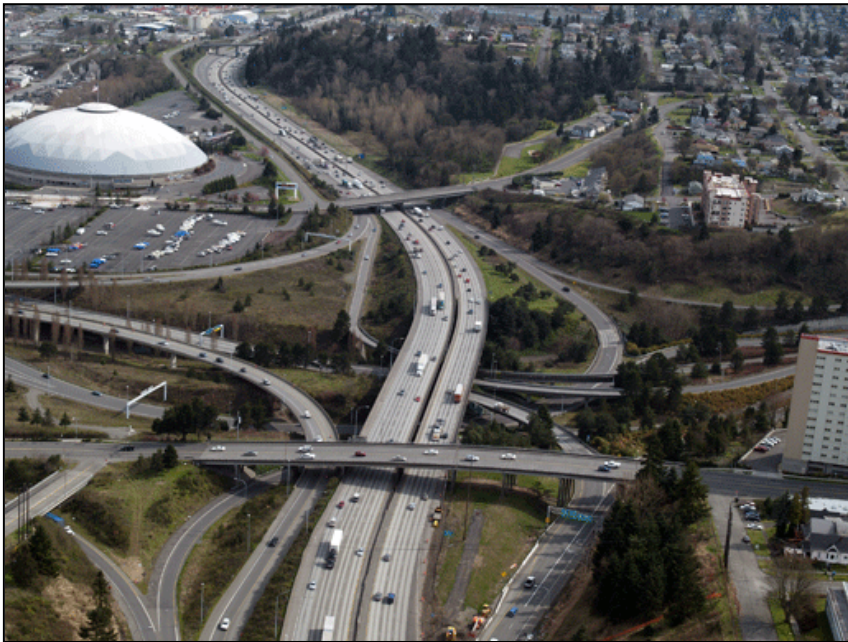
Interstate 5 - Existing